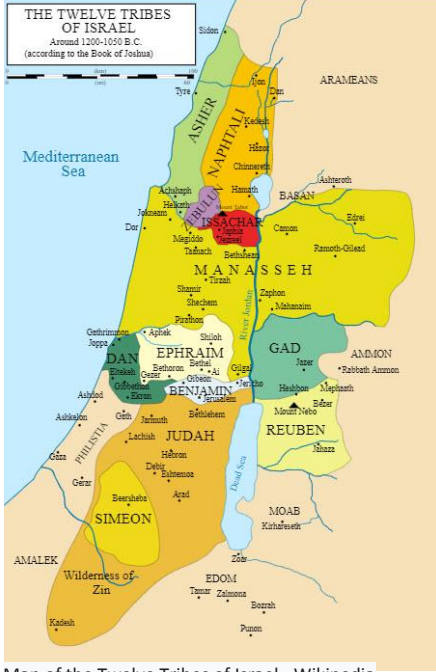
Map of the Twelve Tribes of Israel - Wikipedia